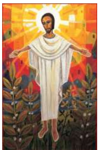
Eternal rest grant unto them, O Lord. And let perpetual light shine upon them. May they rest in peace. Amen.

and all those parishioners whose anniversaries occur around this time.