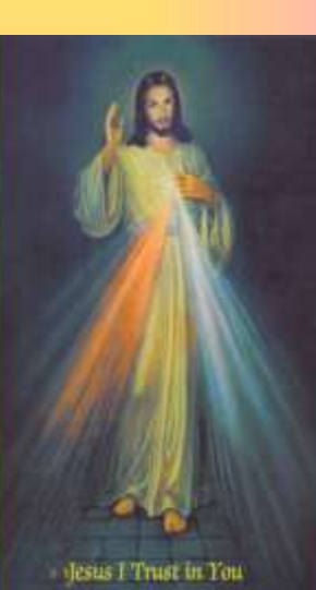
OF YOUR CHARITY PLEASE PRAY FOR THE REPOSE OF THE SOULS OF

These will be recited each Saturday for about 15 mins before the 6:00pm Mass at St. Aloysius.